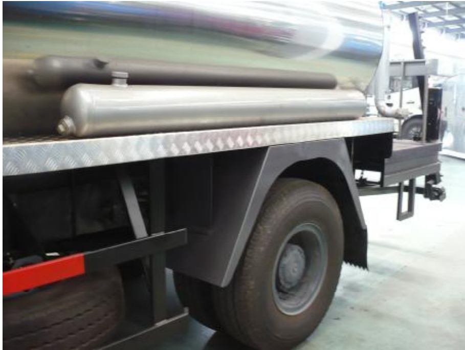
Diesel Cylinder and High Pressure Air Cylinder