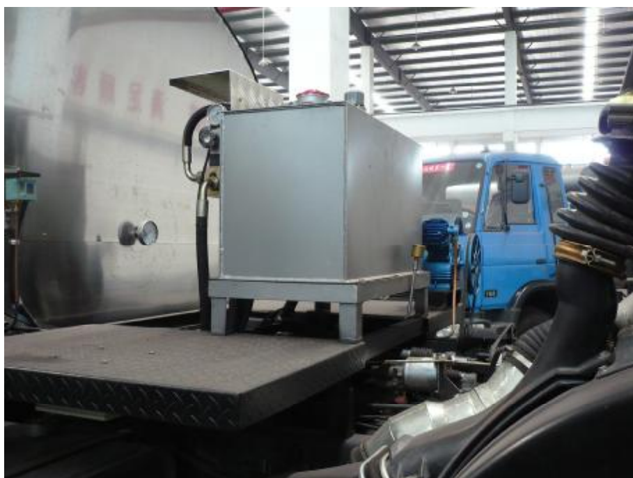
Hydraulic Oil Tank