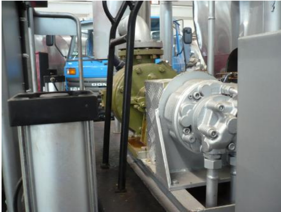
Asphalt Pump and Pipelines